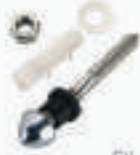
DL-AL02 SS Rack Bolt