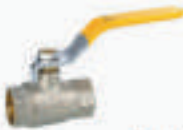
DL-BV01 Ball Valve 15 mm