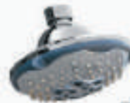
DL-636 5 Setting