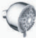
DL-609 3 Setting