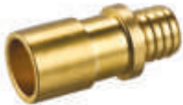
DL-612 Size : 100 x 100 mm