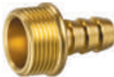
DL-615 Size : 150 x 150 mm