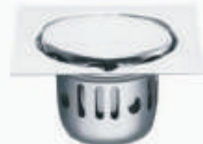
DL-CCT20 Square Size : 140 mm X 140 mm