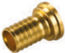
DL-645H Single Setting Size : 150 mm