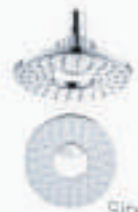
DL-649 Single Setting