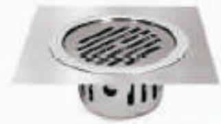
DL-CCT14 Square Classic Size : 150 mm