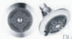
DL-644 3 Setting Size : 75 mm