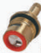
DL-IF02 Quarter Turn Disc 3/4"