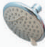
DL-638 2 Setting