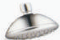
DL-647 5 Setting