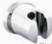
DL-AL03 Hook with Screw