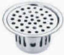
DL-CCT01 Round Size : 125 mm