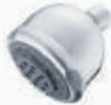
DL-642 2 Setting