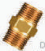
DL-AL01 Brass Hex Nipple Chrome Plated