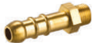
DL-616 Size : 175 x 175 mm