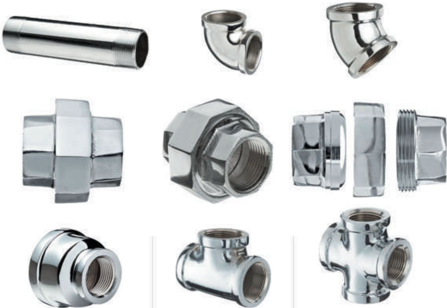
Reducing Coupling, 1" X 1/2" NPT Female