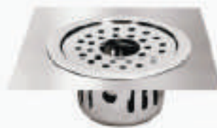
DL-CCT13 Square Gypsy Size : 150 mm