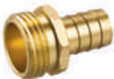
DL-618 Size : 250 x 250 mm