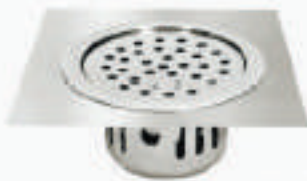
DL-CCT12 Square Size : 150 mm