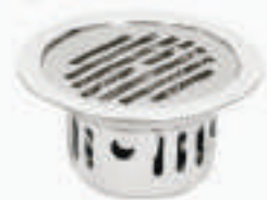
DL-CCT03 Round Classic Size : 125 mm