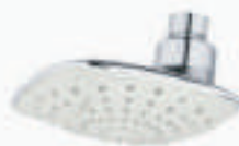
DL-607 2 Setting