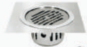
DL-CCT06 Square Classic Size : 125 mm