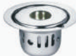
DL-CCT19 Round Gypsy Size : 138 mm