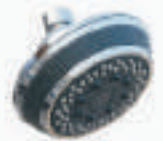
DL-637 5 Setting