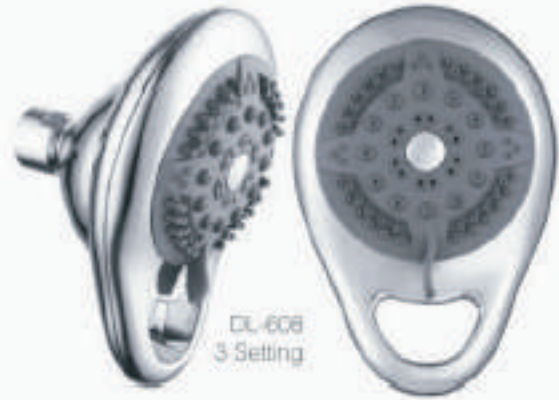
DL-608 3 Setting