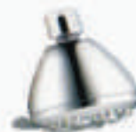
DL-639H 5 Setting