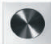
DL-FD304B Square Popup Size : 125x125 mm