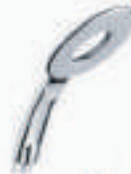
DL-649H Single Setting