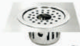
DL-CCT05 Square Gypsy Size : 125 mm