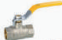
DL-BV03 Ball Valve 25 mm