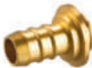
DL-619 Size : 200 x 200 mm