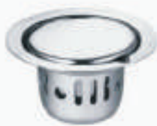
DL-CCT18 Round Size : 138 mm