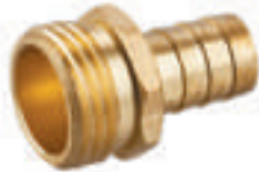
DL-648 2 Setting