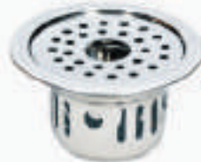
DL-CCT02 Round Gypsy Size : 125 mm