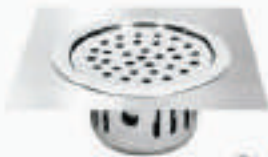
DL-CCT04 Square Size : 125 mm